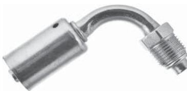
90° Male O-Ring (MTON90)