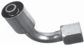
90° Female Flare SAE 45° (FSX90)