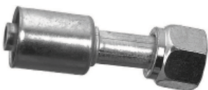
Straight Female O-Ring (FTON)