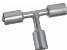
Splicer Tee - 3 way