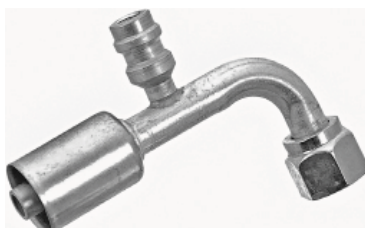
90° Female O-Ring (FTON90) with R134a Service Port