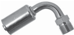
90° Male Insert Oring