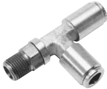
Swivel Male Run Tee