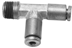
Male Run Tee