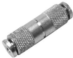
Tube to Tube Union