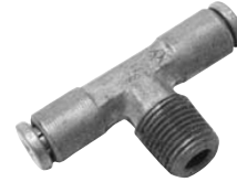
Male Branch Tee