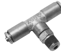
PTCX-DOT-72 Swivel Male Branch Tee