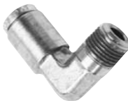
PTC-DOT-69 Male Elbow