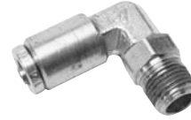
PTCX-DOT-69 Swivel Male Elbow