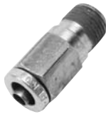
PTC-DOT-68 Male Connector