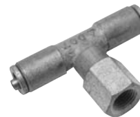
PTCX-DOT-77 Swivel Female Branch Tee