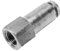
PTC-DOT-66 Female Connector